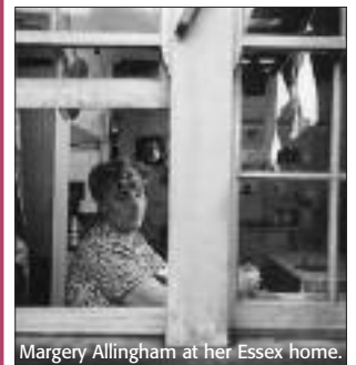
Margery Allingham at her Essex home.

Buy now for £9.99 - saving £4 off the RRP!